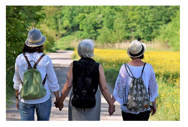
21-22 May 2022 Weekend Wksp

You may feel it's a long road ahead, And you rather be anyone else but you instead. Just keep strong and hold on tight, Because one day you learn to live with the pain and things will be alright.